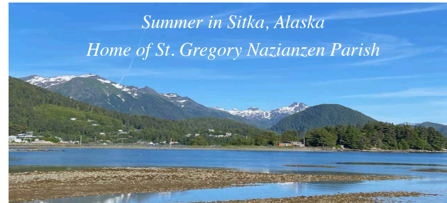
Summer in Sitka, Alaska Home of St. Gregory Nazianzen Parish

The Archdiocese of Anchorage-Juneau's Offices of Faith Formation and Safe Environment Want all children, youth and families to enjoy a Safe and Faith filled Summer!